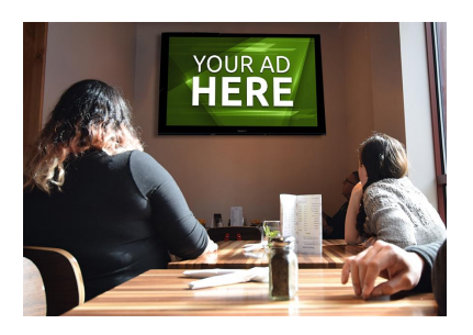
BARS | RESTAURANTS