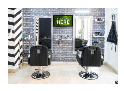
HEALTH AND BEAUTY